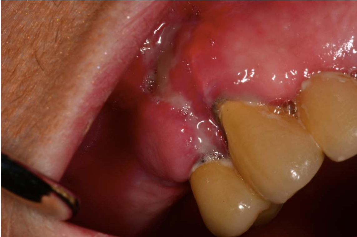
4 days of applying blue® oral gel