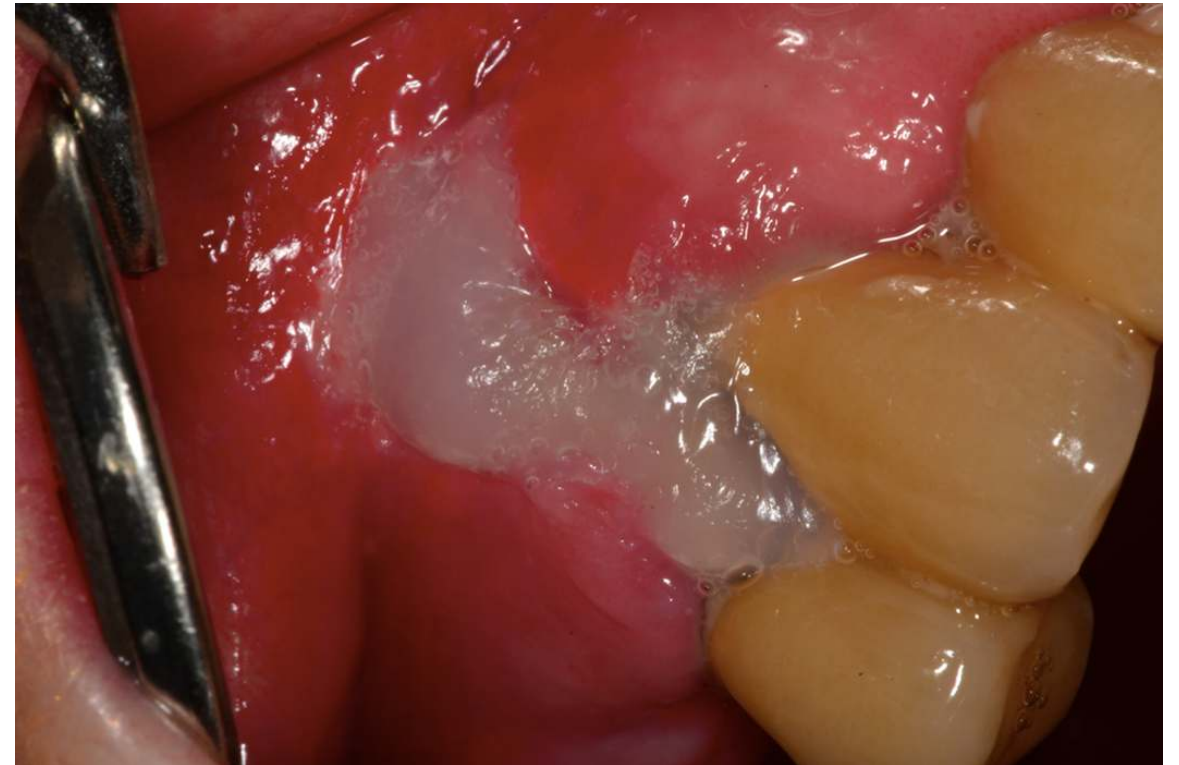
application of blue® oral gel